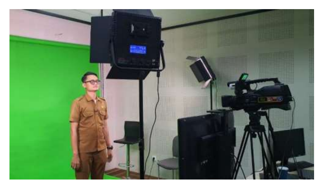
Figure 4. Filming Process of Online Learning Materials.

ISSN: 2747-2027 (Print) / 2747-2035 (Online) DOI: https://doi.org/10.53624/kontribusi.v3i2.209