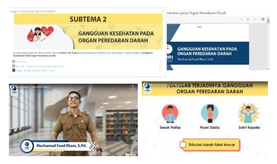
Figure 6. Digital Education Materials for SDN Kemuning.

Post-pandemic, the online learning process has become an alternative learning method in education, including at the primary school level. In its implementation, there are indeed advantages and disadvantages in carrying it out.