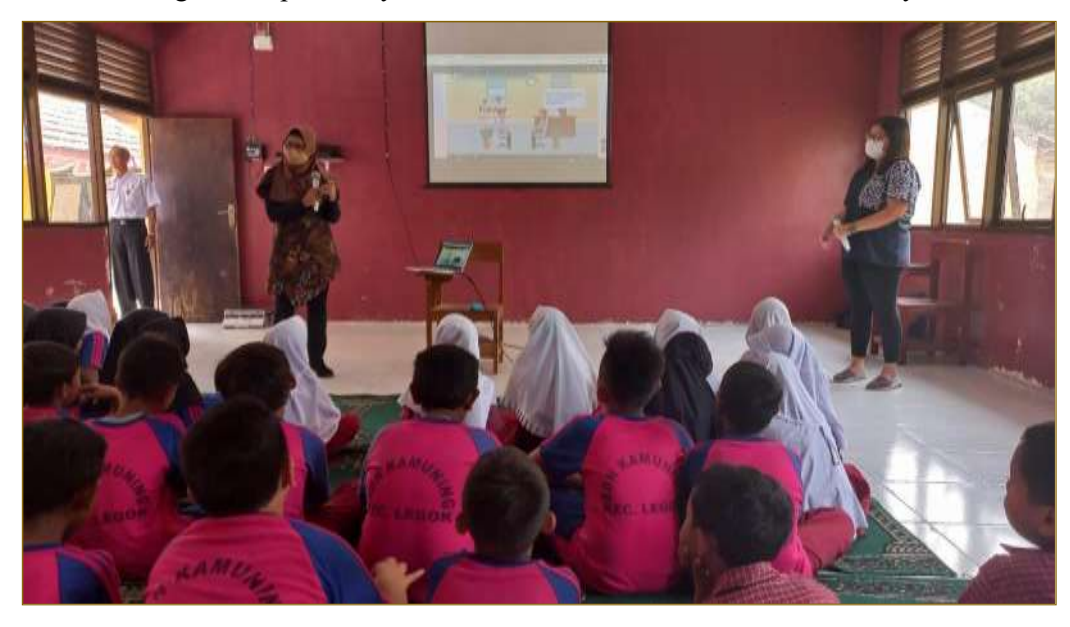
Figure 3. Introduction of Online Learning Method to Elementary Students.

After it was decided that the class to be tested with online learning was class V, the next step was for the lecturer team to socialise the use of the LMS to teachers and students of class V offline at SDN Kamuning, accompanied by teachers who served as PICs for the activity.